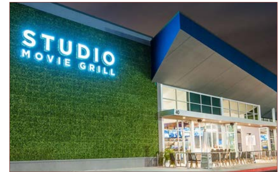
Rendering of Proposed Redevelopment